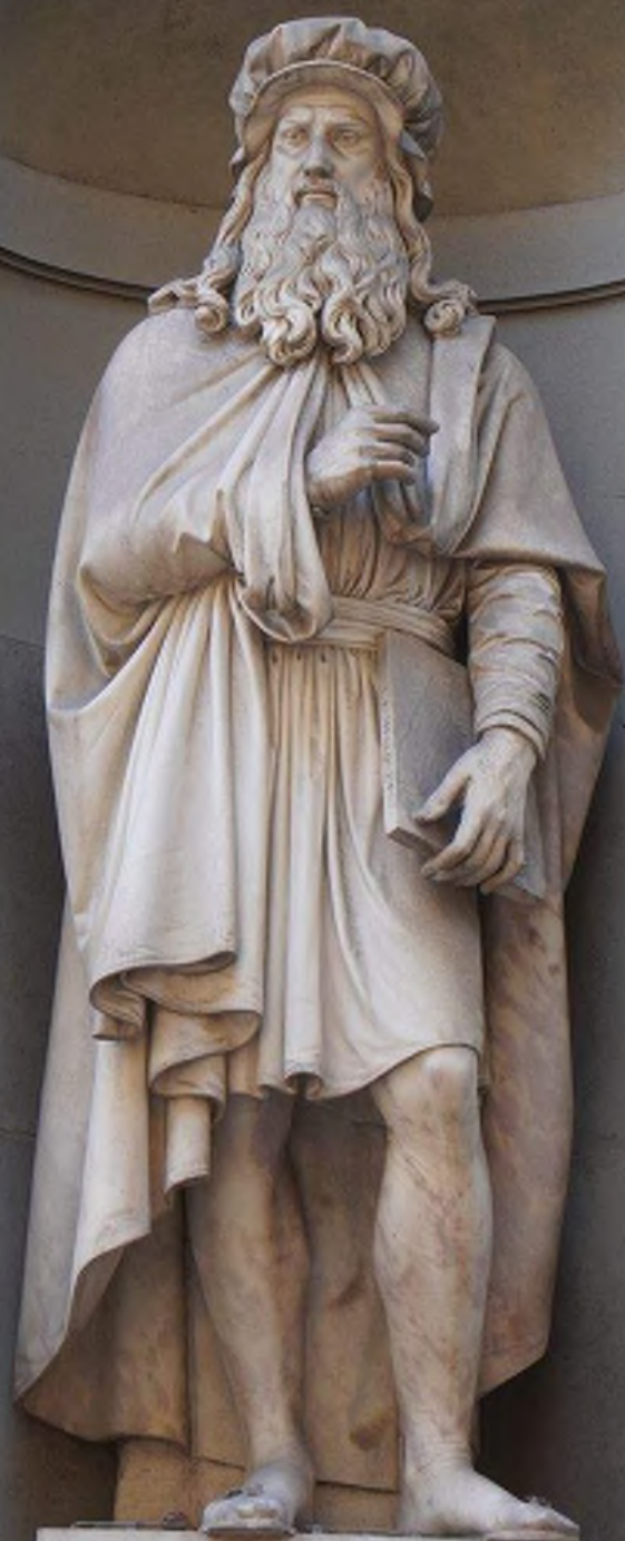
LEONARDO DA VINCI