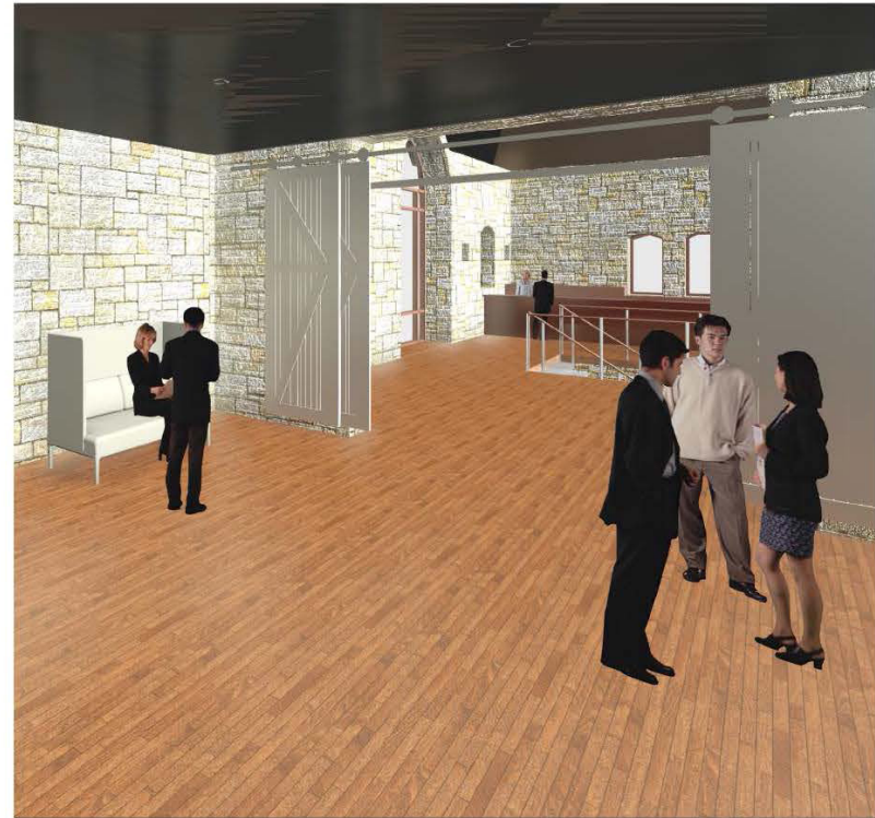
Carriage House ~ ideal for small gathering and winter events