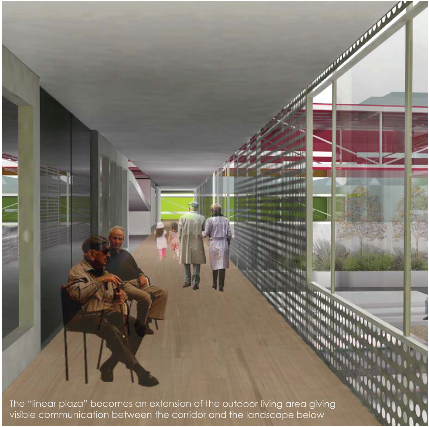
The "linear plaza" becomes an extension of the outdoor living area giving visible communication between the corridor and the landscape below